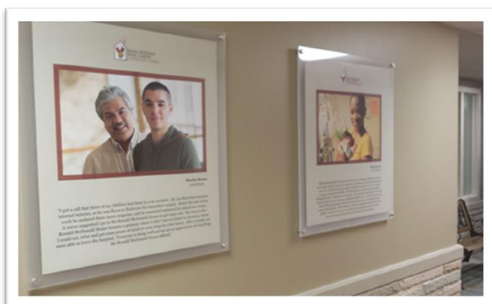
Visitors are able to learn about the RMH through the stories of past families that are featured in the hallway leading to the Ronald McDonald House.