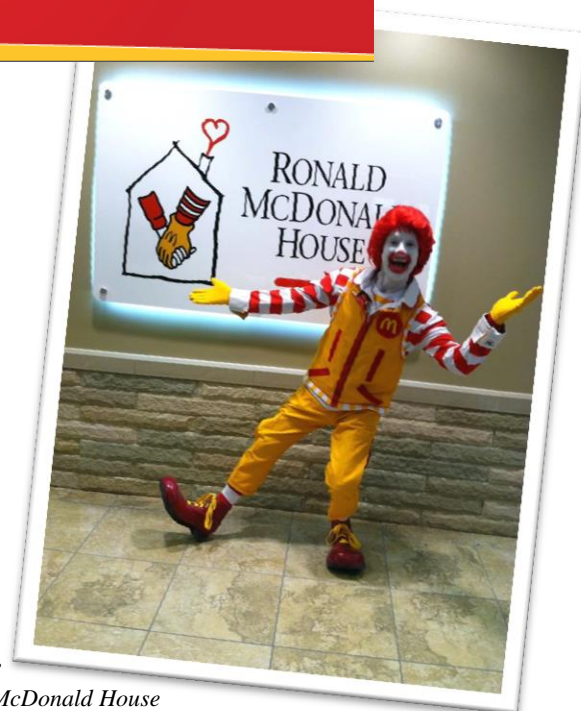
Ronald poses in front of the new Ronald McDonald House sign which welcomes guests as they enter the hospital.