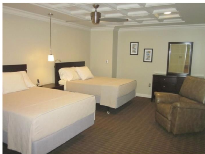
Of the four, newly added guestrooms, two feature two double beds, which is helpful for families staying in the House with children. All 15 guestrooms offer comfortable Tempurpedic mattresses and La-Z-Boy recliners.